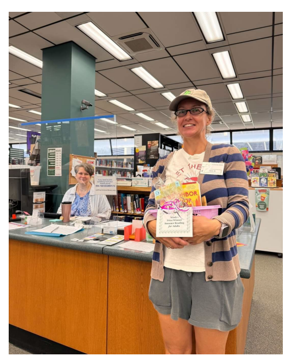
Week 1 Winner -